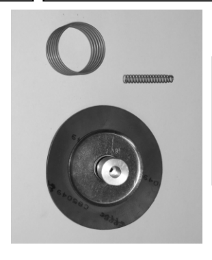
Solenoid Repair Kits: