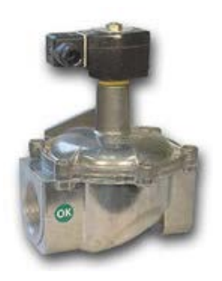
Series 300 1 ½" - 2"

This Manual covers most typical ISIMET Solenoids. If information is needed for any other ISIMET Solenoid, please contact an ISIMET Service Representative.