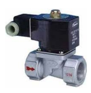
Series 300 ½"- 1 ¼"