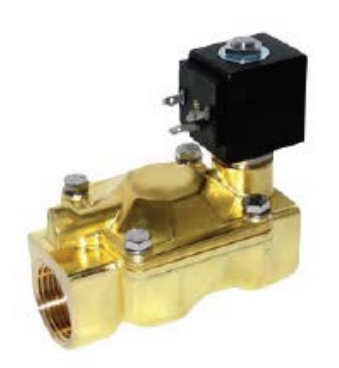
Series 200 & 220