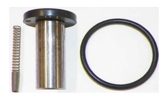
1/2" - 3/4" Solenoids