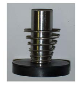
1" - 1 1/4" Solenoids