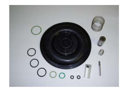
1 1/2" - 2" Solenoids